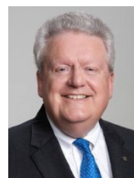
R.I. PRESIDENT 2019-20120